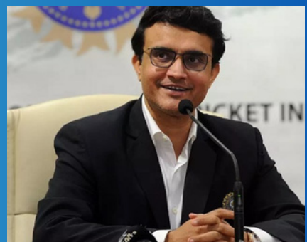
Sourav Ganguly 8th July