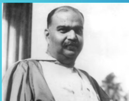
Shyama Prasad Mukherjee 6th July